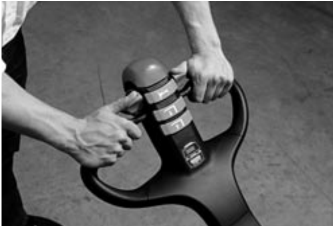
Easily operated by both left and right-handed users