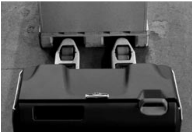
Practical layout provides good fork tips visibility