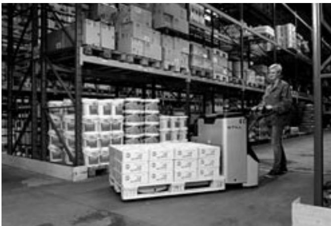
The ECU is right at home transporting goods horizontally for industry, trade and commerce