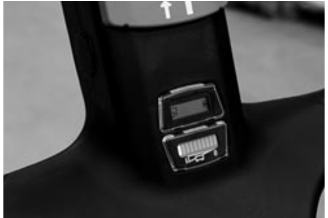
Clear display of battery condition and operating hours